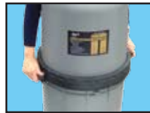
Locking Ring With Safety Latch.