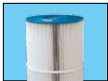
Single Cartridge Element