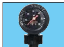
Optional Pressure Gauge/Air Relief Valve w/Clean/Dirty Indicator

Combination Pressure Gauge/Air Relief valve with Clean/Dirty indicator available