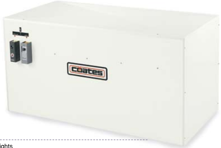
PHS-20 THREE PHASE

All electrical components are easily accessible under the conveniently hinged cover. Terminal blocks are provided for simplified power supply wiring.