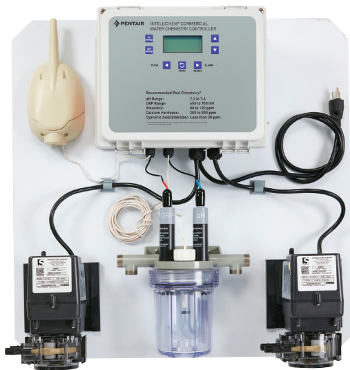
Plug & play installation with all components pre-mounted and pre-wired. IntelliChem with 2 pump configuration option.